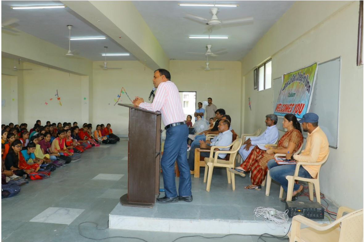
(Lecture for nutrition and hygiene)

Time to time, campus organized the lecture on Nutrition & female hygiene. A special lecture on Durga Shakti App for safety & security of girl student.