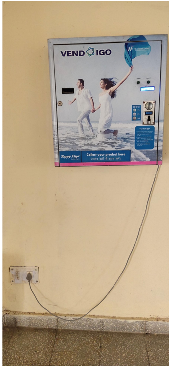
(Vending Machine for girls students)

Campus follows legal legislation about student protection and safety. For the girl student, the campus provides her vending machine.