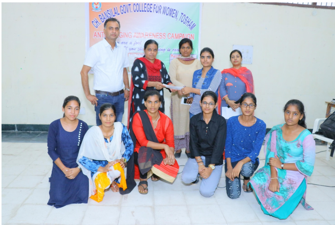
(Anti-ragging awareness Camp)

Anti – ragging cell in the also provide in the campus so that the fresher student feel safe from the senior students.