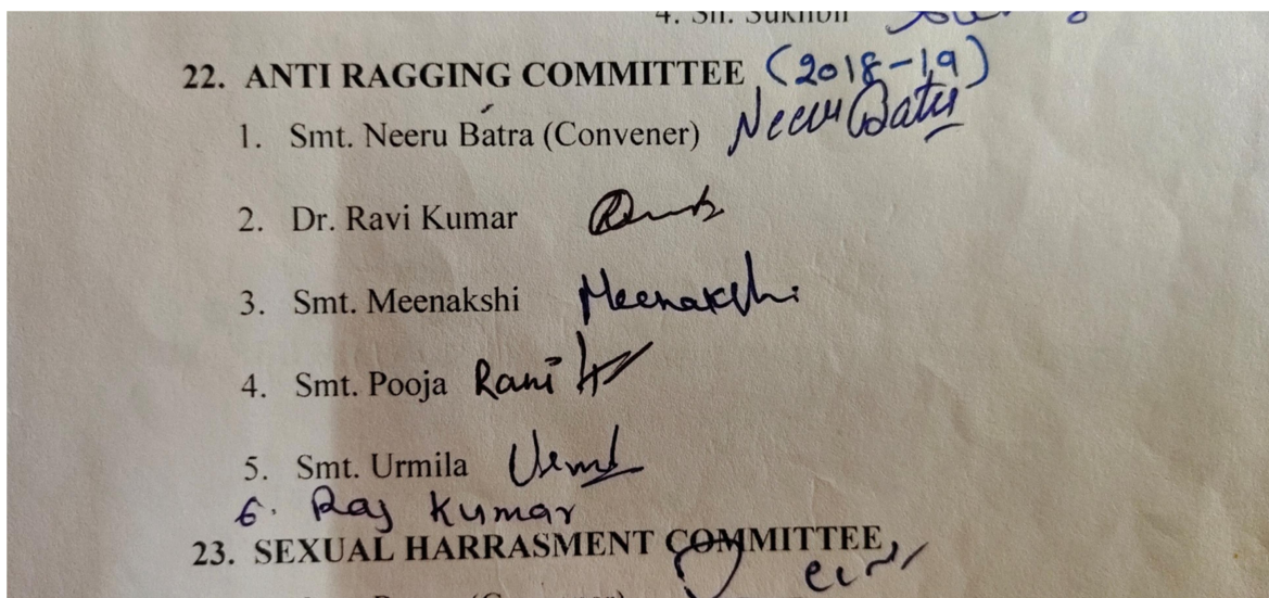
(Anti-ragging Committee 2018-19)