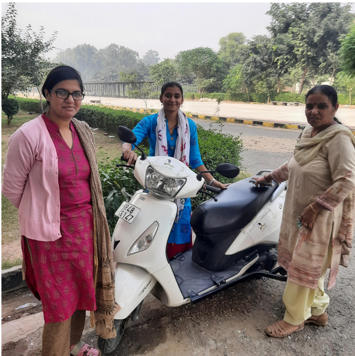
Students who are physically challenged, handicapped, campus provides her scooty and so many facilities.