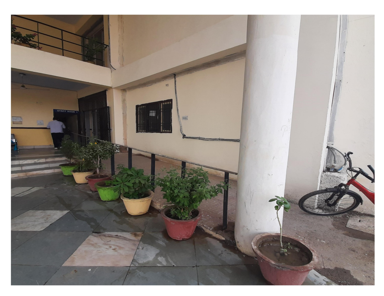
(Ramp for easy access to classrooms)