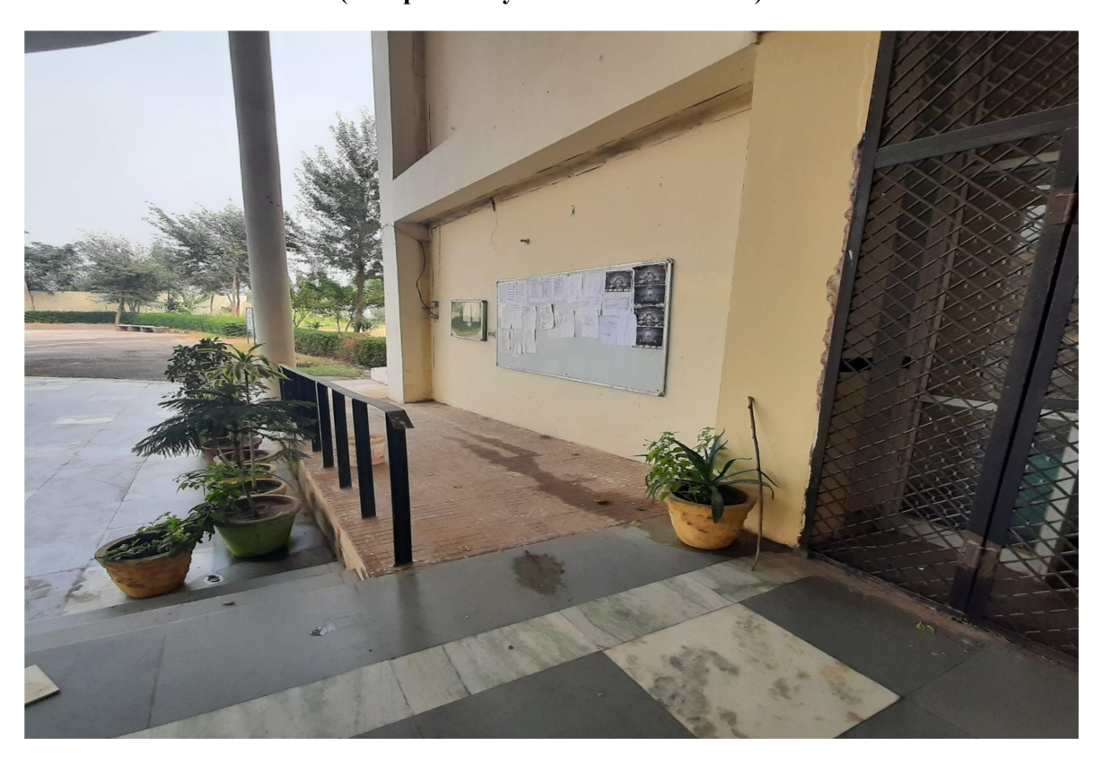
(Ramp for easy access to classrooms)