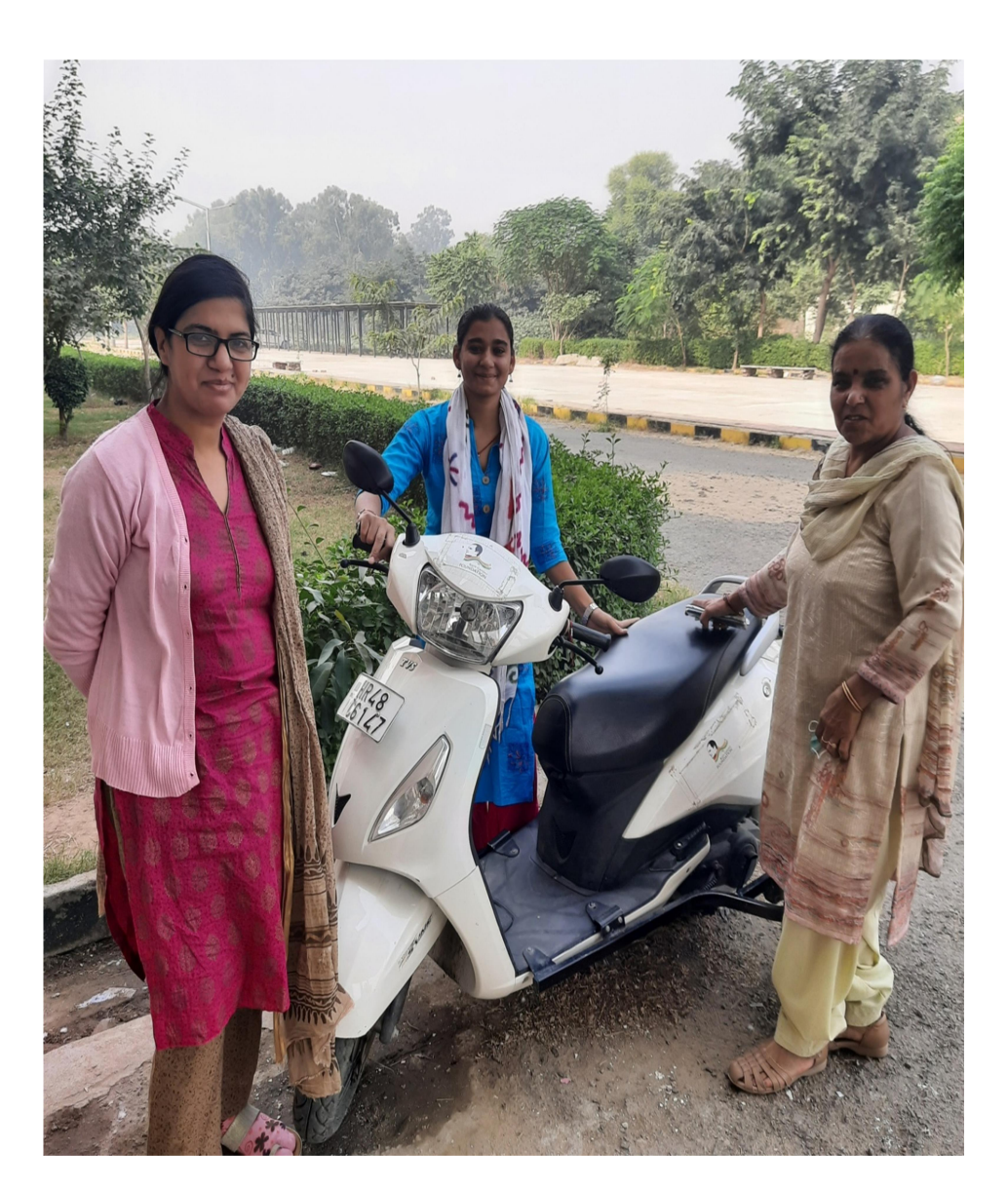
(Disabled friendly Vehicle)