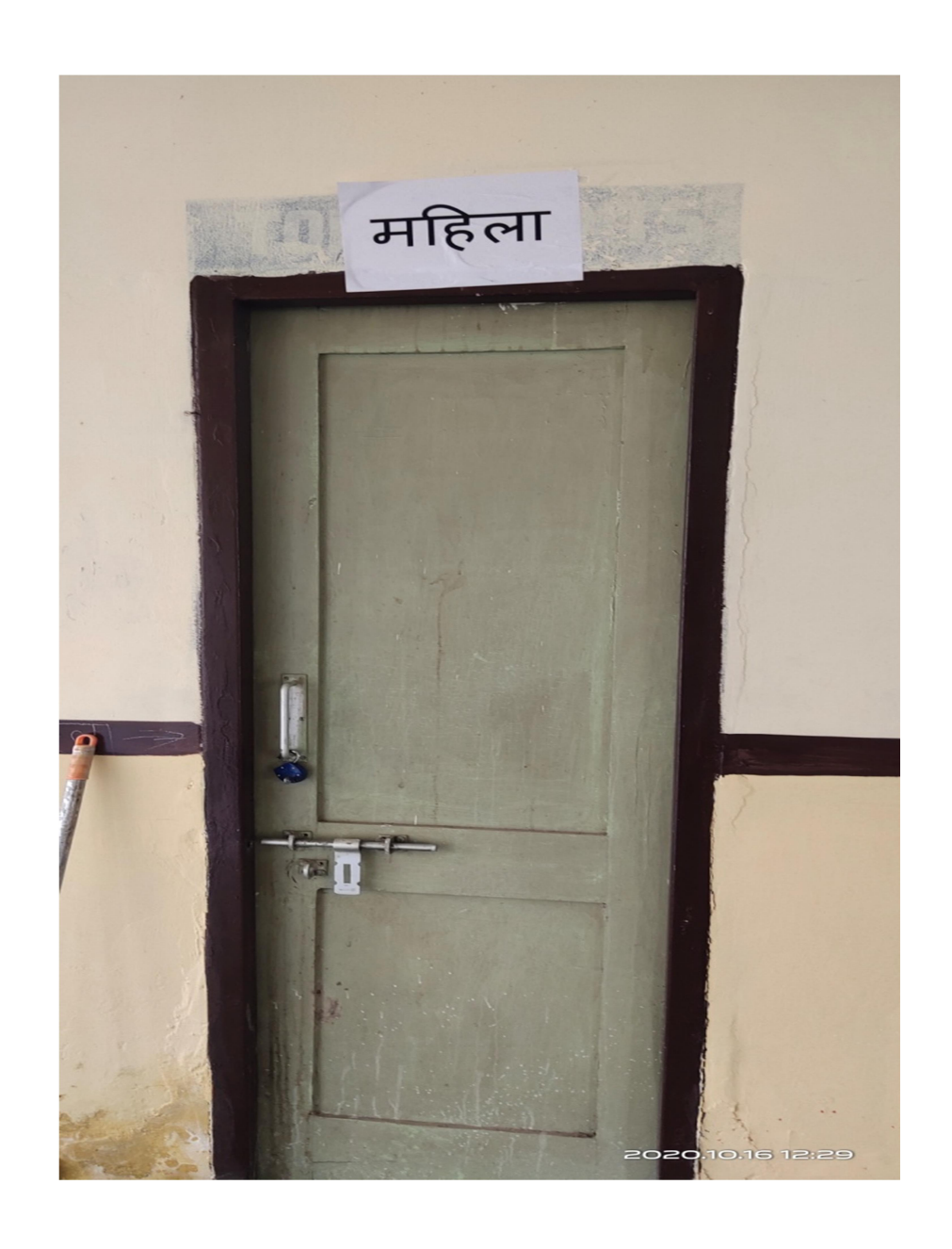
(Disabled friendly washroom)